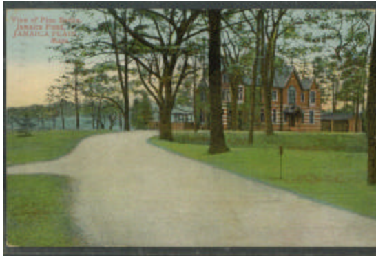
This historic card shows the sweep of the carriage drive from the nearby Jamaica way

From 1913 to 1936, Pinebank served as the first Children's Museum. From 1936 to 1970, it was occupied by the Engineering Department of the Boston Parks Commission. From 1970 to 1975, Pinebank was used for a city-sponsored community arts program. Since then, Pinebank has been abandoned, awaiting its next opportunity to serve the Boston artistic community.